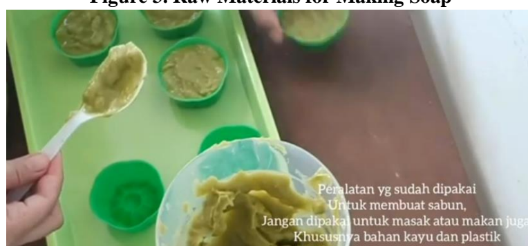
Figure 4. Soap Making Printing