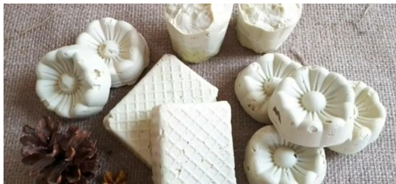
Figure 5. Soap that is ready, packaged, marketed and used

Evaluation of this activity is carried out by providing critique sheets and suggestions to the training participants at the end of the event. The aspects that are reviewed are everything from registration to practice. Based on the results of the critique sheet and suggestions, it shows that they are very happy with this event. According to them, the training they received was new and useful. In addition, they are motivated and enthusiastic to receive similar trainings and hope that this collaboration will continue to be held every year. In addition, they also gave criticism that this event was too short and the materials used were not enough