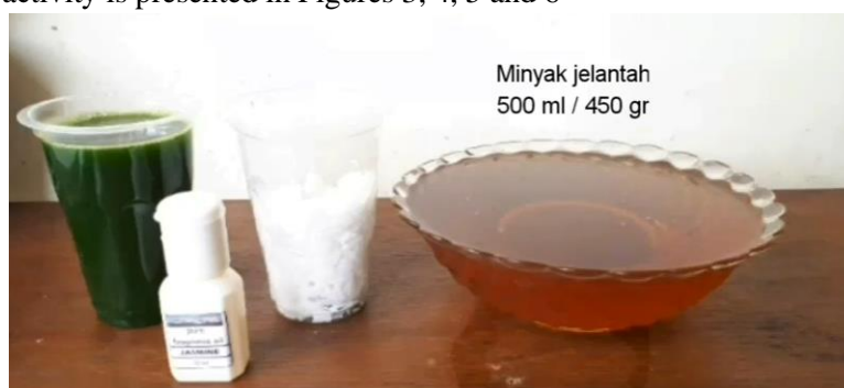
Figure 3. Raw Materials for Making Soap

The core activity of community service in the form of training on making dish soap from used cooking oil was carried out on November 20, 2021 at the house of Mrs. Betty, the Chairperson of RT 03 RW 01 Sukaratu. The activity was attended by 46 members of the PKK RT 03 RW 01 Sukaratu community. The training includes explanations, video playback, and simple practice. Residents were very enthusiastic about listening to the explanations of the service team as seen from the questions asked during the training. The community is enthusiastic about participating in service activities because the material presented can increase knowledge and skills and provide entrepreneurial insight. The product from community service in the form of dish soap from used cooking oil was also exhibited in the village competition as an innovative product of RW 01 Sukaratu. The implementation of this community service activity is presented in Figures 3, 4, 5 and 6