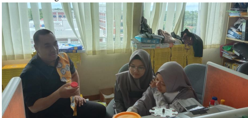
Figure 6. Evaluation of Service Activity Results

Evaluation of this activity is carried out by providing critique sheets and suggestions to the training participants at the end of the event. The aspects that are reviewed are everything from registration to practice. Based on the results of the critique sheet and suggestions, it shows that they are very happy with this event. According to them, the training they received was new and useful. In addition, they are motivated and enthusiastic to receive similar trainings and hope that this collaboration will continue to be held every year. In addition, they also gave criticism that this event was too short and the materials used were not enough