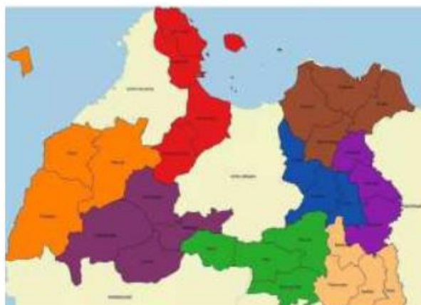
Figure 1. Geographical Map of Serang Regency

The strategic geographical location of Sukaratu Village and beautiful natural conditions allow tourism to develop rapidly. Sukaratu Village has an area of 4.23 km 2 consisting of 5 hamlets, 5 community units, and 11 neighborhood units. because it is classified as a village that has a high number of poor people, 34% of the total 2273 households. The total population of this village reaches 6536 people, with a relatively equal number of male and female residents. The land potential in this village is actually quite good, namely 94 ha of rice fields with very good irrigation because there is a water source, 178 ha of dry land, 66.11 ha of public facilities out of a total area of 4.23 km 2 .